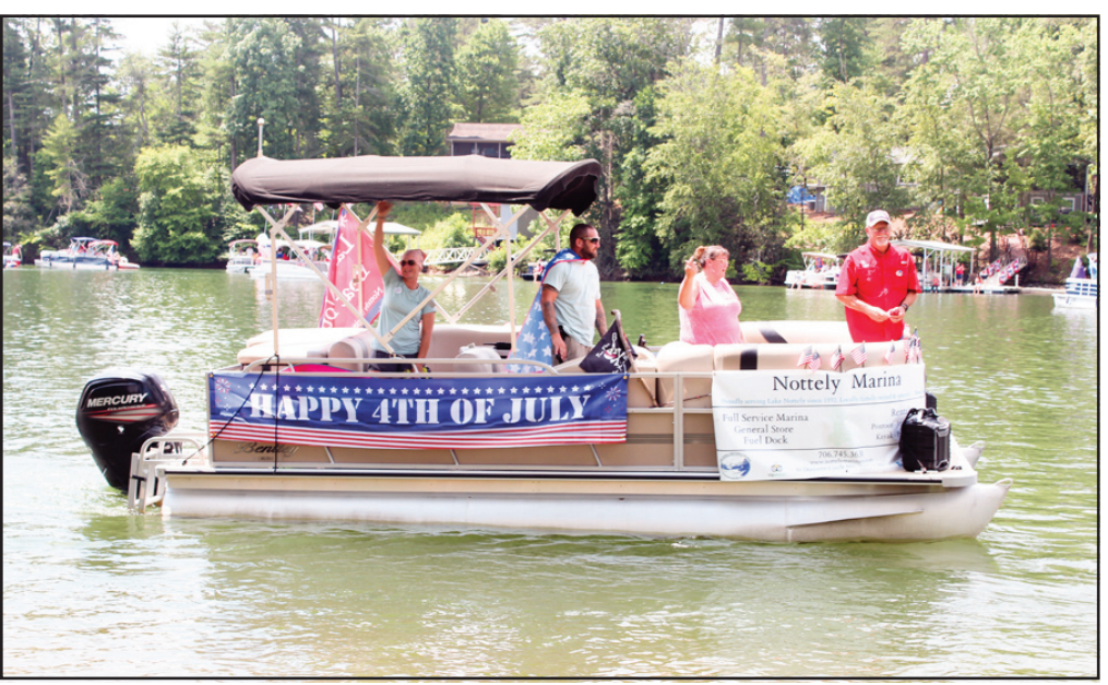
The Nottely Marina staff passed out trophies for crowd-favorite floats in the boat parade Saturday.

And then there was the with every pass around the inclusion of an amphibious car. Unlike the boats around him, the driver didn't require a motley crew, and he could Osborne's "Crazy Train" from be seen smiling and giving