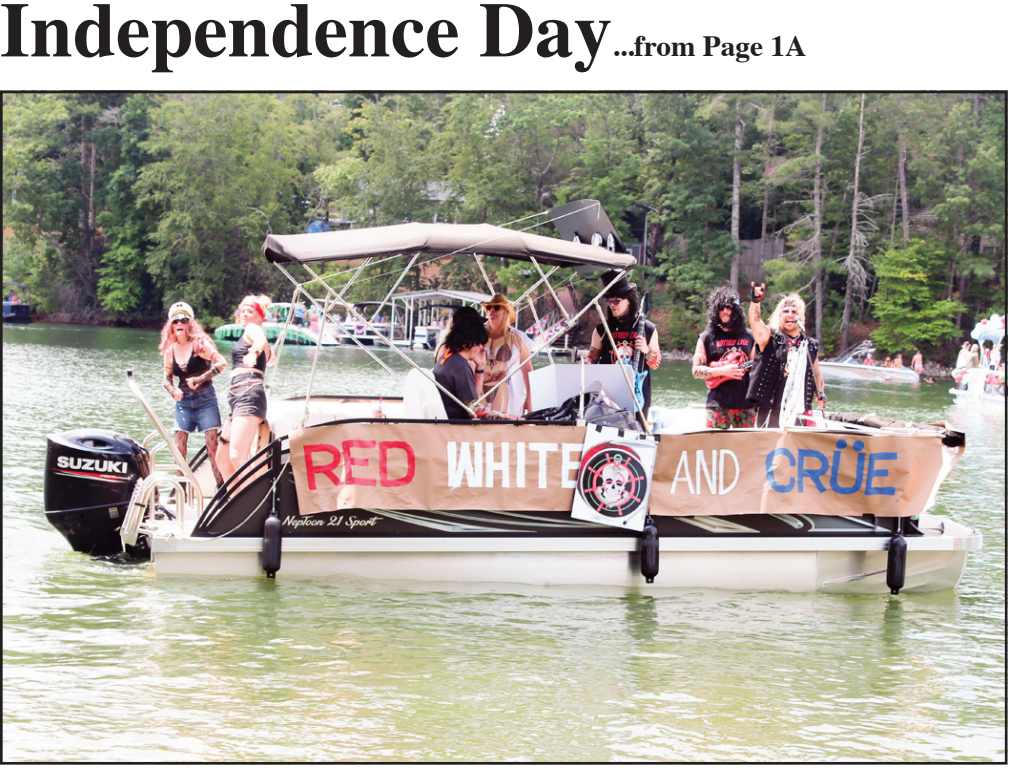
The '80s-inspired motley crew of the "Nottely Crue" boat at the 2022 Nottely Boat Parade July 2.

The Blairsville City Council meets the second Tuesday of each month at 6 p.m. inside City Hall.